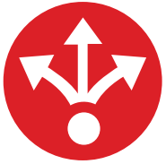
Solar PV product distribution