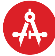
Solar PV Engineering Services